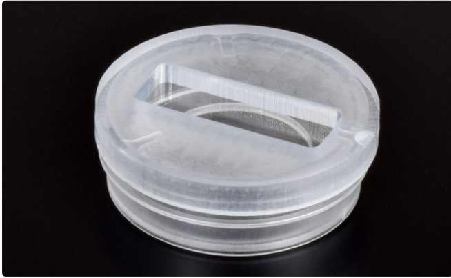
HoloLid placed on a ibidi \mu -Dish 35 mm, high (left). The area marked blue is the observation window which is immersed into the cell media (right).

HoloLid has been especially designed for the HoloMonitor® time-lapse cytometer to eliminate image disturbances caused by surface vibrations and condensation inside the cell culture vessel. HoloLid (cat. # 71111) is designed to fit ibidi cat. # 81176 for wound healing experiments, but also fits ibidi \mu -Dish 35 mm, high (cat. # 81156) without culture inserts for wound healing. HoloLid can be reused at least 10 times. However, after extensive use the repeated sterilization will noticeably degrade the optical quality of the lid.